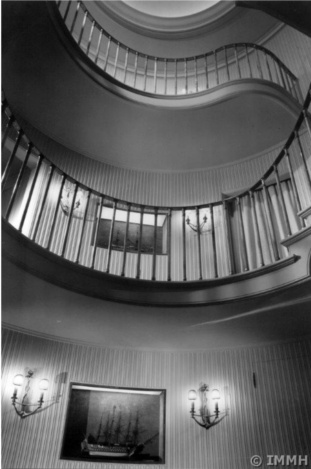
Showcases along the staircase